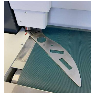
Motorized height adjustment, automatic setting of thickness using a limit switch (optional)