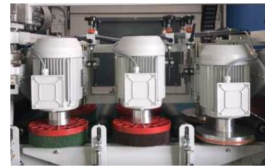
Setting for deburring and intensive edge rounding