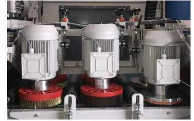
Setting for deburring, edge rounding and oxide removal in one pass

Costs: This “disc only” concept makes it possible to dispense with expensive vacuum or magnetic hold down features and thus allows the machine to be priced competitively. Low energy consumption and inexpensive abrasive costs ensure a speedy return on investment.