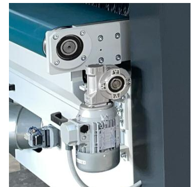
Rotating cleaning brush for feed belt (optional)