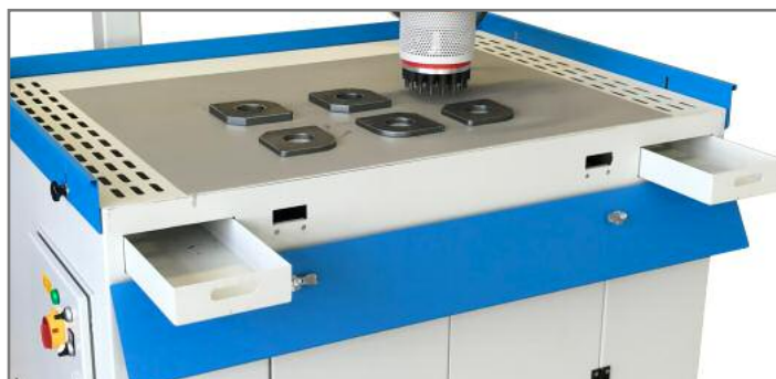
Dust draw right and left