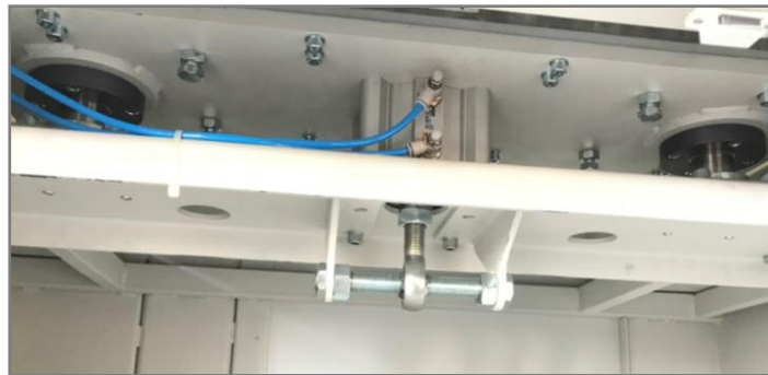
Magnets be activated upper position and deactivated lower position

With the Quick Fix connector the edge rounding disc can be changed against a deburring disc within seconds (Option).