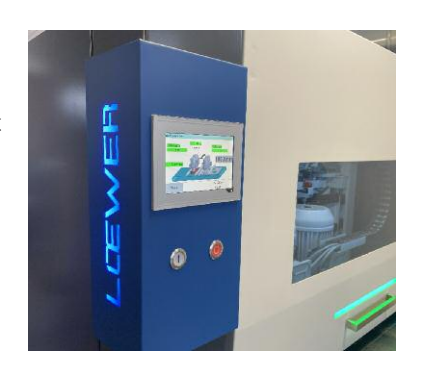
Touch panel control (optional)