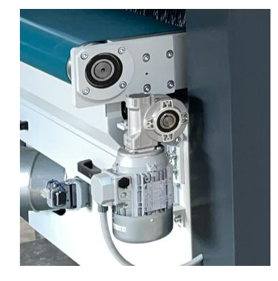
Rotating cleaning brush for feed belt (optional)