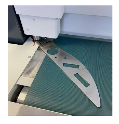
Motorized height adjustment, automatic setting of thickness using a limit switch (optional)