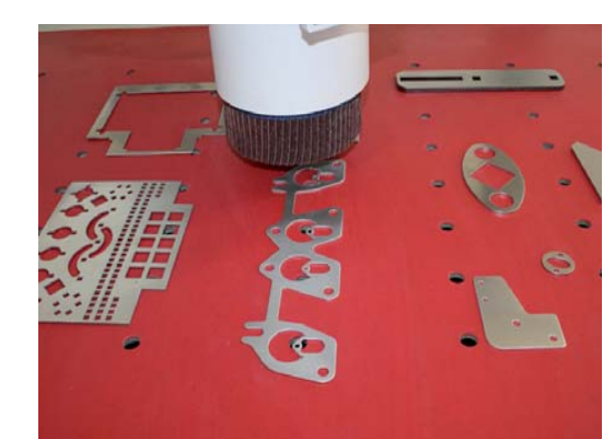
High-grip table cover for holding even very small parts