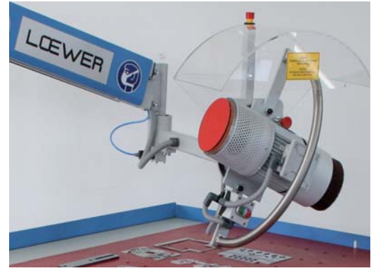
180^\circ tiltable head for quick access to deburring and edge rouding tools